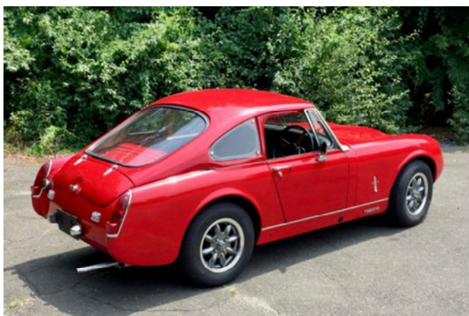
Ashley GT roundtail