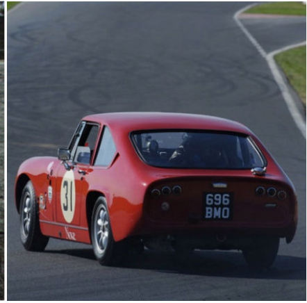
Lenham Le Mans fastback