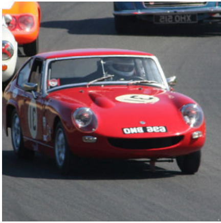
Lenham GT bonnet