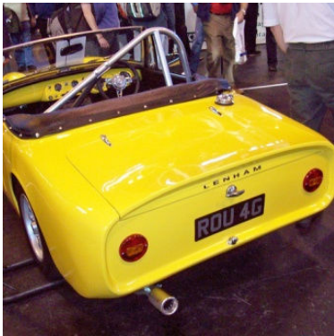
Lenham GTO rear